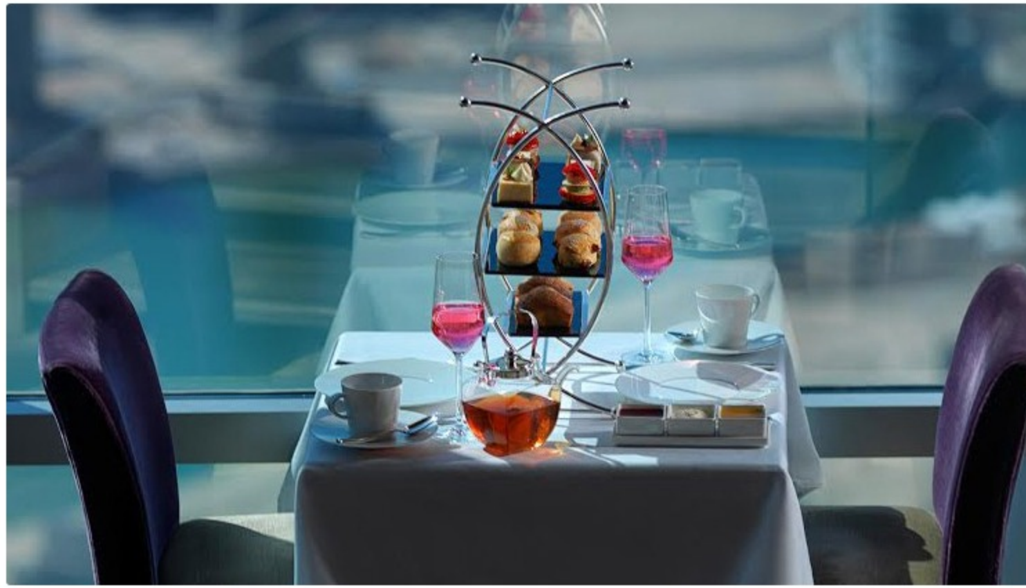
New menus at Level 122, At.mosphere Restaurant, Burj Khalifa

The restaurant's brand of international cuisine, specialties that are the essence of the homegrown flavours paired with the best of sea and land. Our culinary team takes you on a gentle stroll through the kitchen garden from the top of the world's tallest tower, with innovative preparations and tasting opportunities that transform the humble vegetable into an exquisite mouthful. Savor the very best of international seasonal produce.